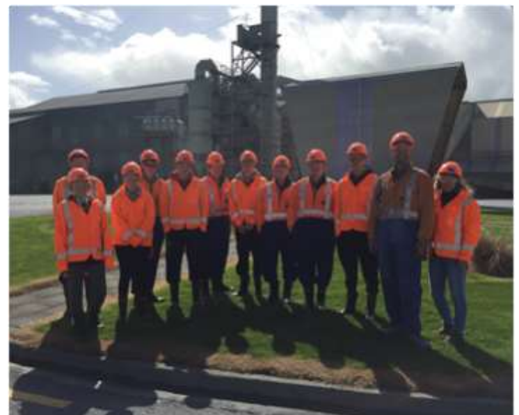
Ballance Fertiliser Trip