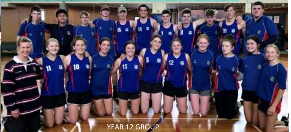
YEAR 12 GROUP