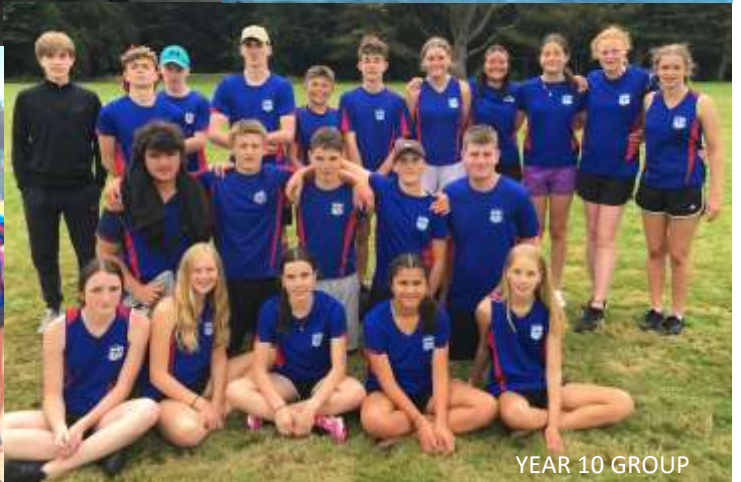
YEAR 10 GROUP