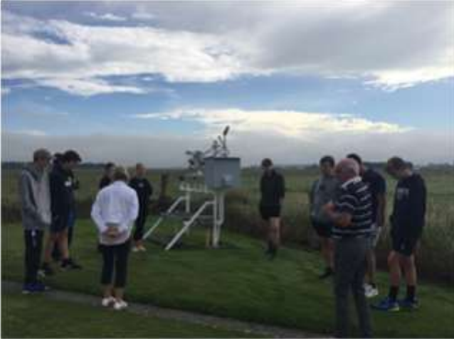
Invercargill Weather Station