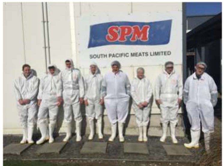
South Pacific Meats Limited