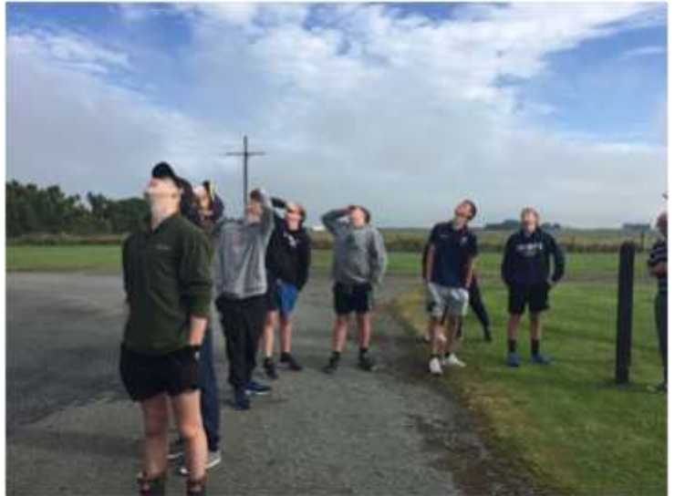
Watching the weather balloon that is released each day at 10.15am