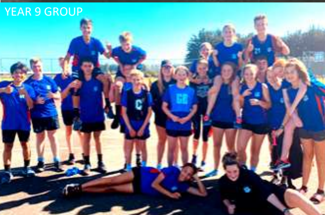
YEAR 9 GROUP