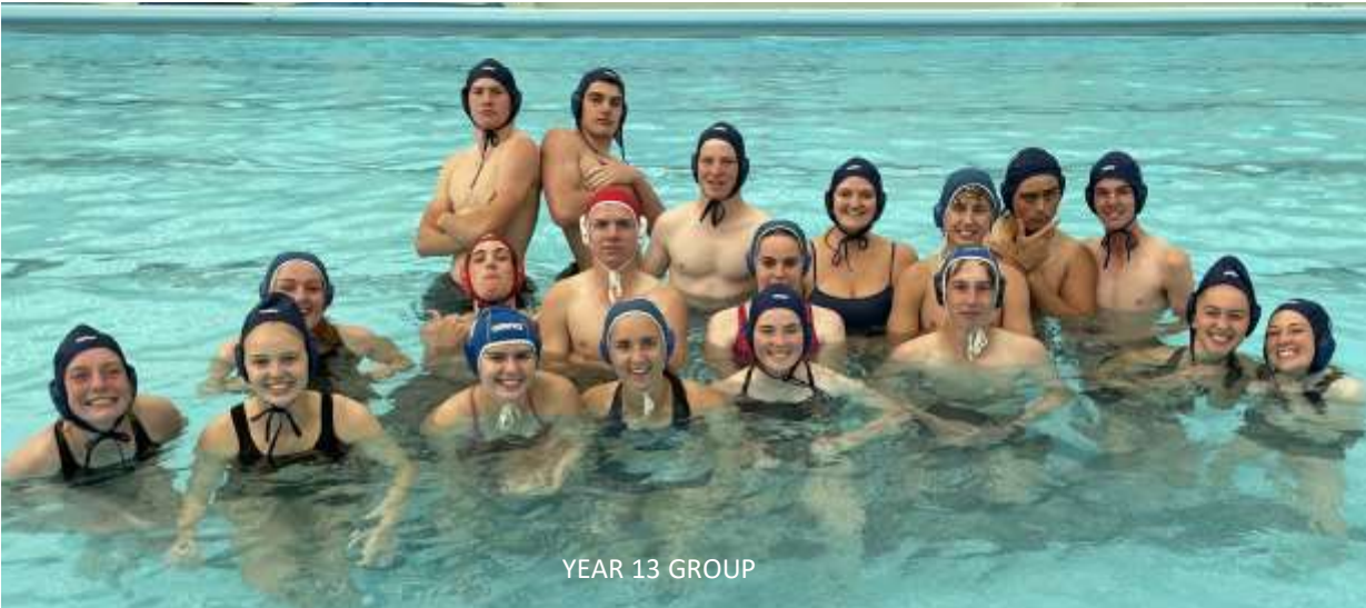
YEAR 13 GROUP