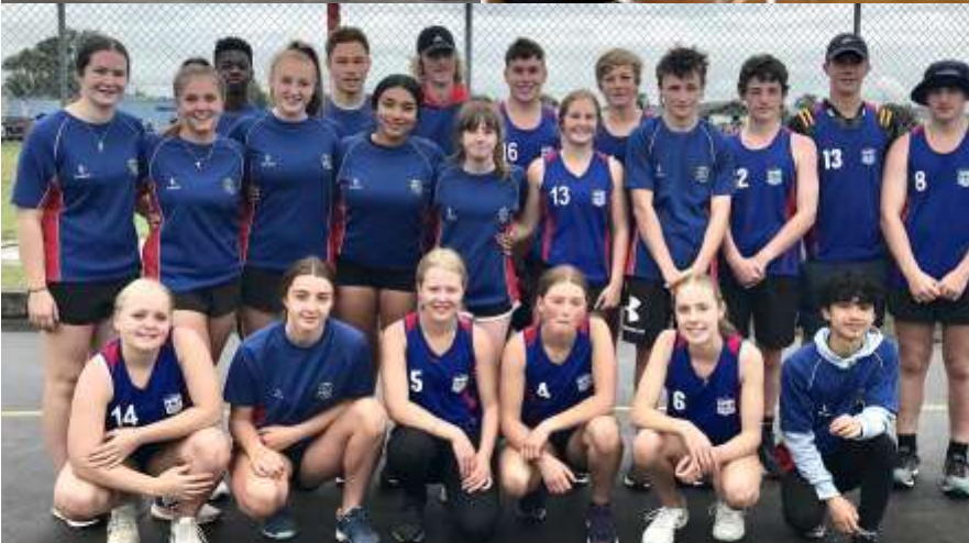
YEAR 11 GROUP