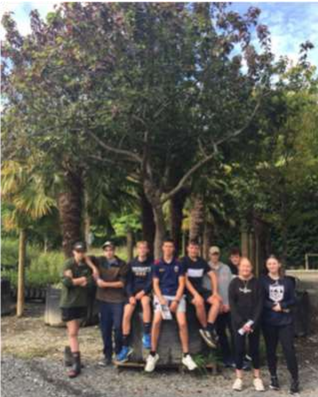
Easy Big Trees Visit