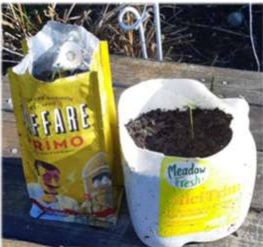
Make sure to punch holes in bottom to help drainage

If you have natives growing at home, have a look around the base of the trees to see if there are little seedlings growing there. You don't need to buy fancy pots to transfer them. As you can see, foil coffee bags and milk bottles cut in half will do the same job as a plastic pot from the garden centre. Re-using and re-purposing products that can be rubbish at home reduces the waste going to landfills and helps make our world a bit more sustainable. If you have spare native seedlings we would love you to add them to our tree project.