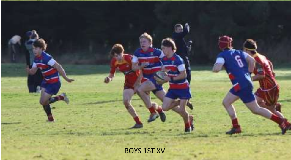
BOYS 1ST XV