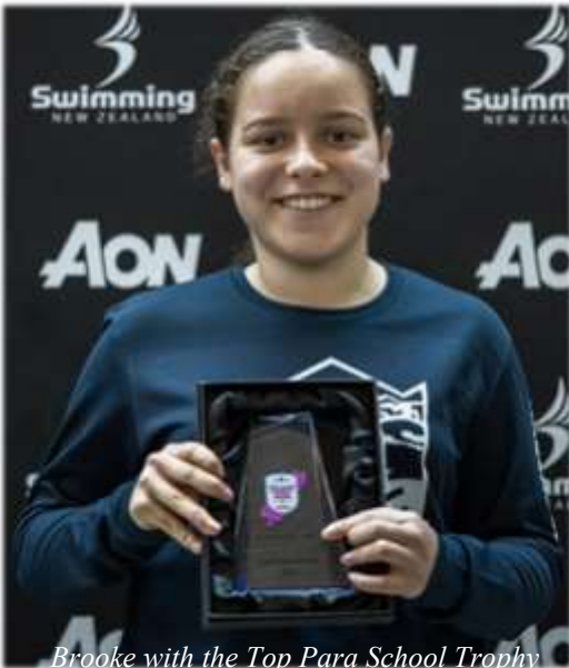
Brooke with the Top Para School Trophy

To cap the weekend off, CSC was also awarded the top Para School for the competition and finished 7th overall out of 30 schools.