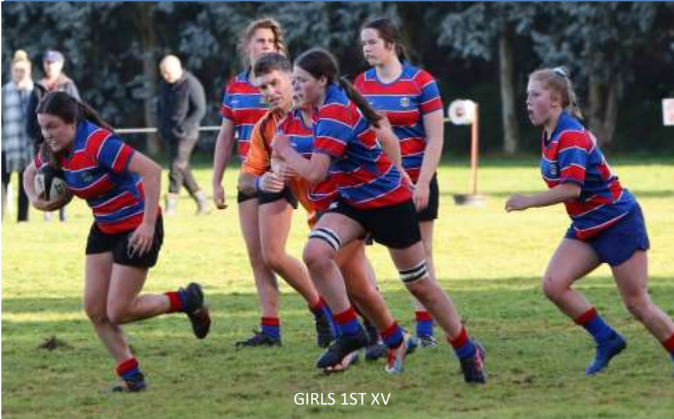
GIRLS 1ST XV