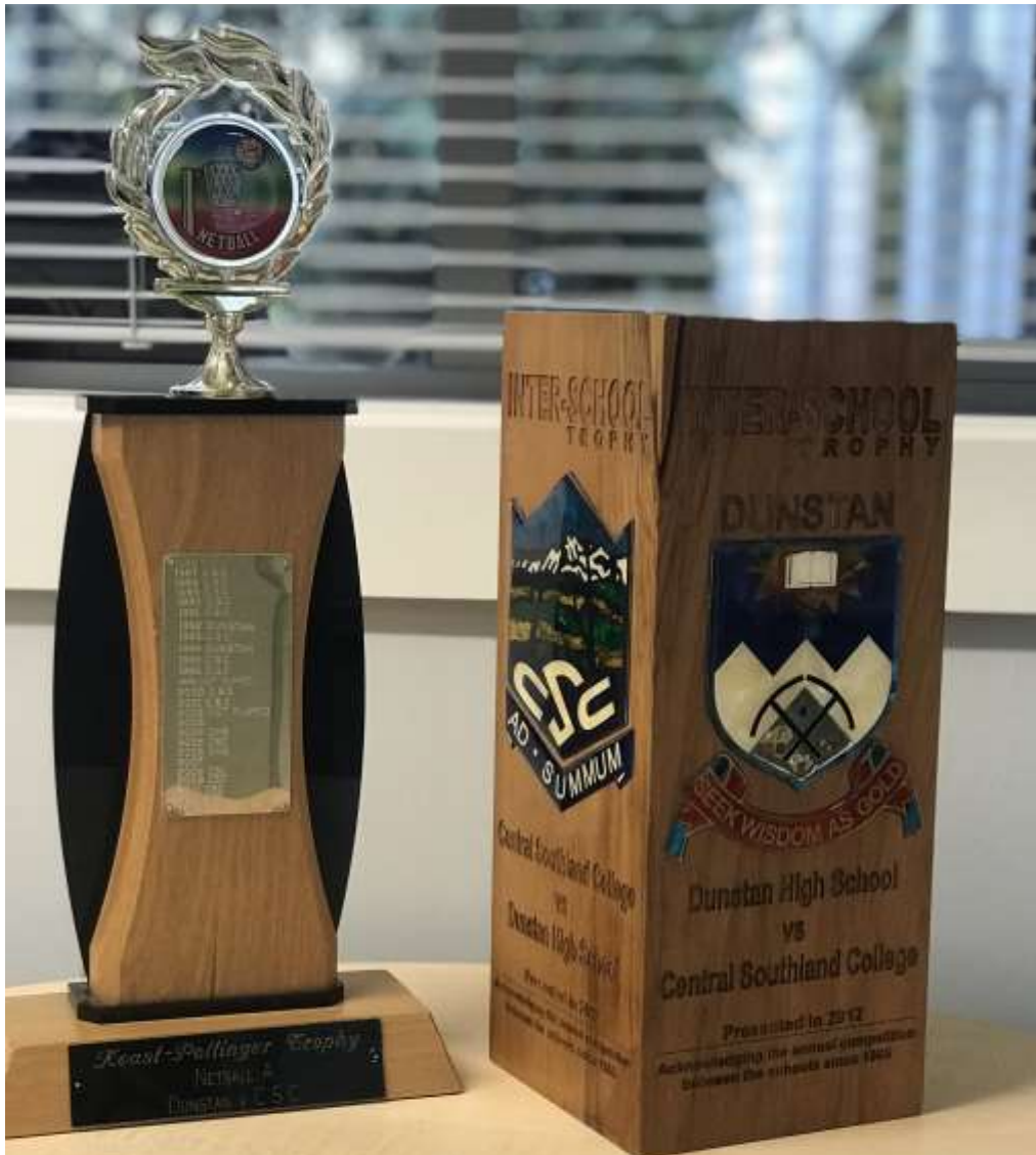
The Dunstan Exchange Interschool Trophies are back in the CSC trophy cabinet!