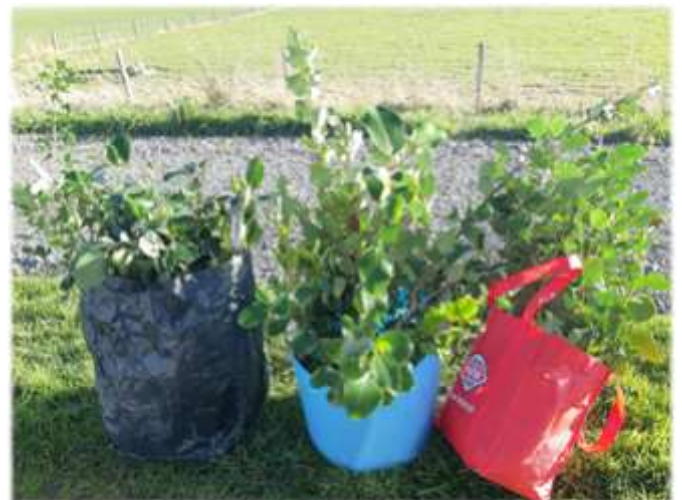
Big thanks to Christine Summers for these Broadleaf seedlings