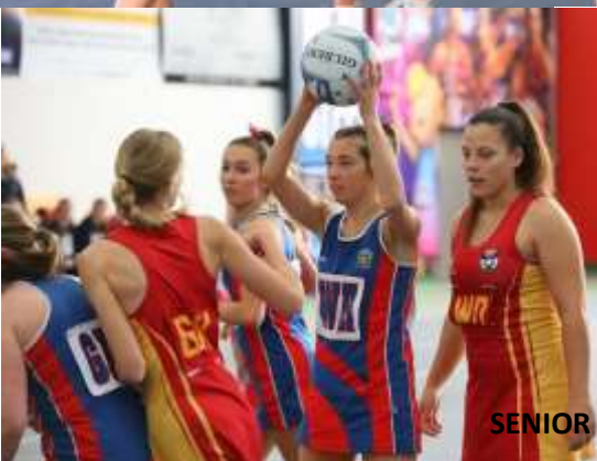
SENIOR A NETBALL