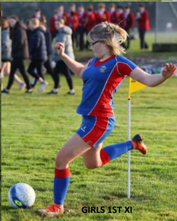
GIRLS 1ST XI