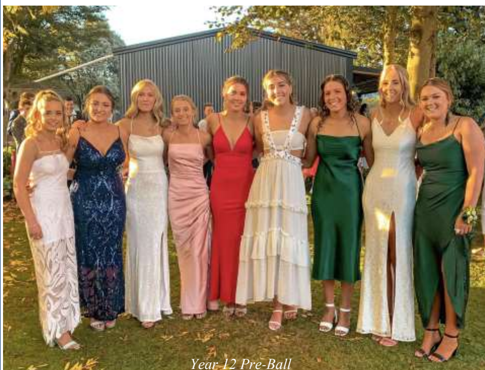
Year 12 Pre-Ball

The CSC Annual School Ball was held last Friday night, 9th April 2021 after lots of planning and excitement over the previous weeks. The Year 13 students (above) held a pre-ball gathering at The Hideaway 201 before heading to the Ballgown Parade and on to the Memorial Hall where they joined the Year 12 students for the ball.