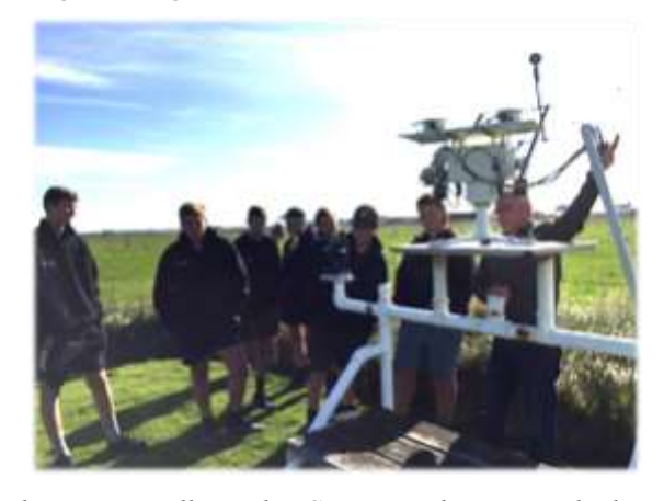
At the Invercargill Weather Station students get to look at the instruments used for recording weather information