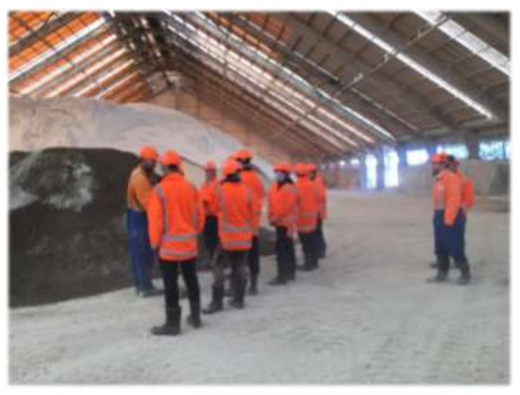
Left and Above: Viewing the stockpiles of fertiliser at the Ballance Fertiliser Plant and outside the plant.