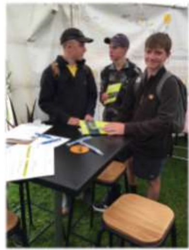
Above: Students collecting their booklets at the Waimumu Field days - they participated in a "Beef and Lamb Careers in Farming" challenge.

The students are really getting an in-depth look at what careers are available in the agricultural sector, while working through their Unit Standards back at school.