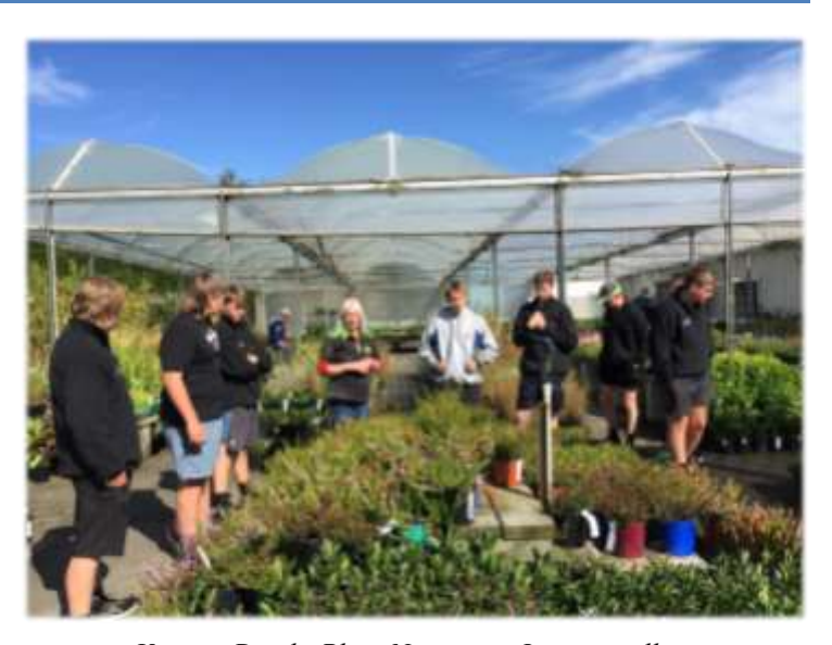
Visiting Diacks Plant Nursery in Invercargill