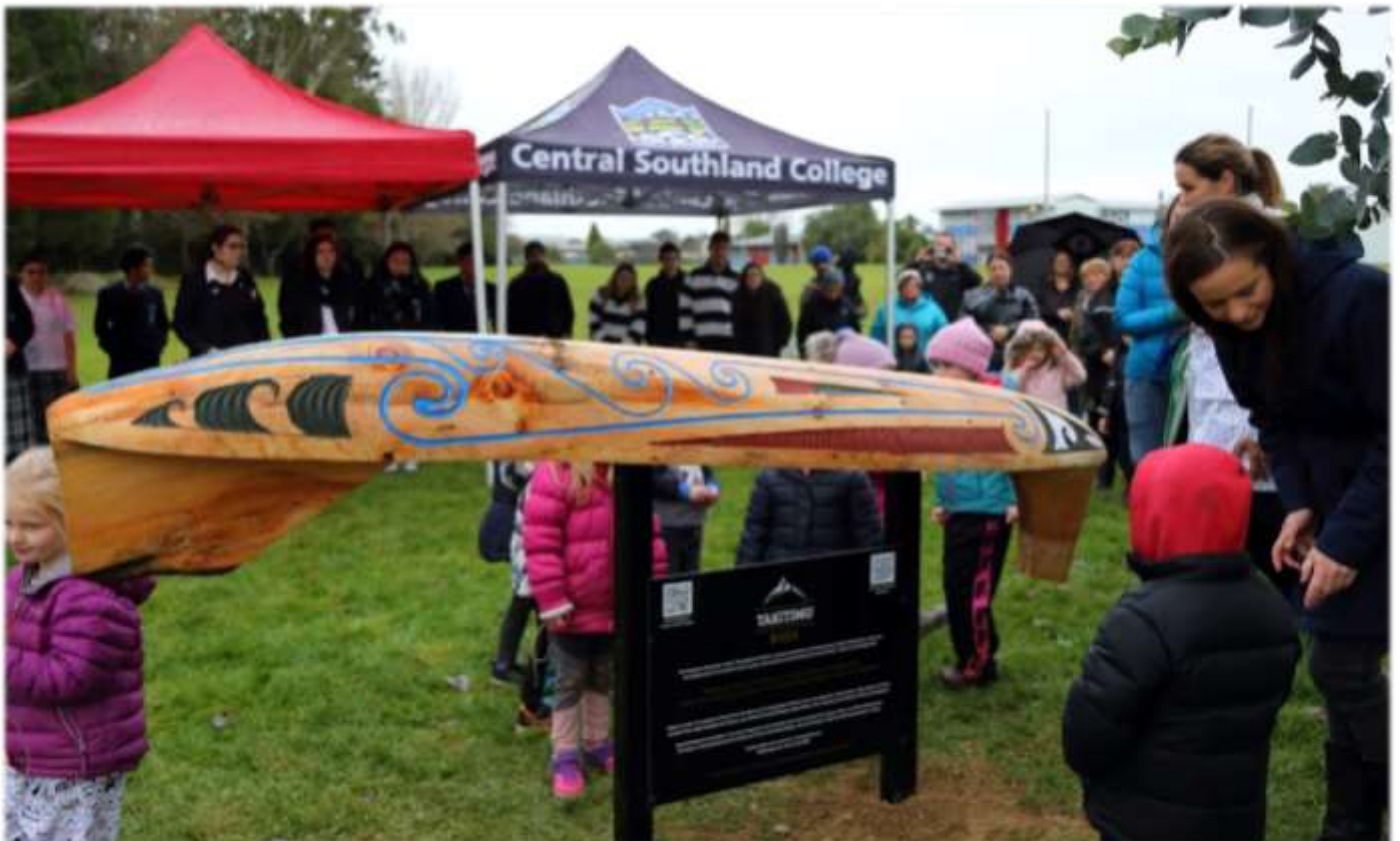
The beautiful carved waka and sign after it was unveiled