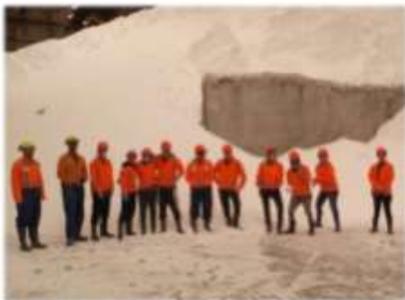
In front of mountain of urea at the Ballance Fertiliser Plant

This term has been a busy one, with the Year 11 students going on field trips to the PGG Wrightson Woolstore, the Invercargill Weather Station and a Forestry Information Day held in Winton. A full day was spent at AFFCO/SPM Freezing Works, Ballance Fertiliser Plant and Diacks Nurseries, with another full day visiting Craiggpine Processing Plant and driving out to the Anderson logging operation at Hillend. Students are getting an in depth look at what careers are available in the agricultural sector, while working through their Unit Standards back at school.