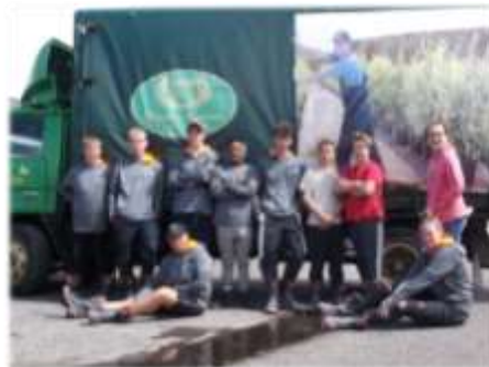
In front of Diacks Nursery delivery truck