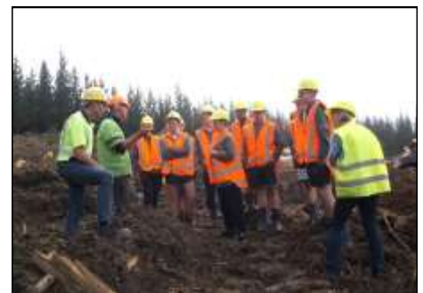
Andersons Logging Operation at Hillend