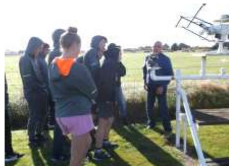
Visit to Invercargill Weather Station