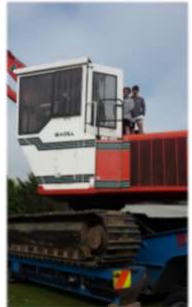
At the Forestry Information Day