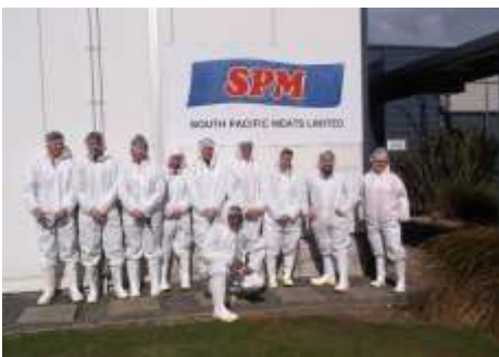
AFFCO/SPM Freezing Works